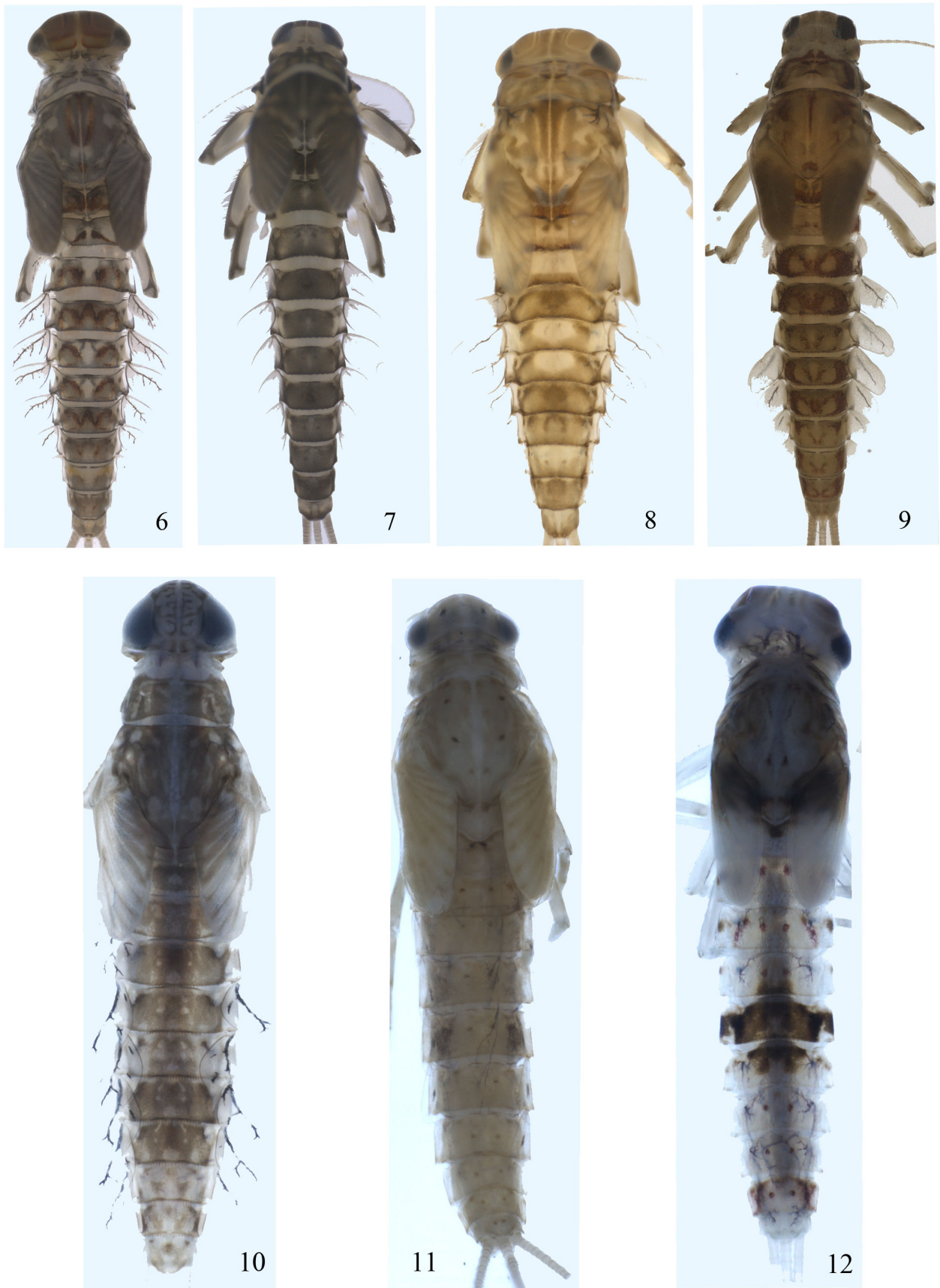
FIGURES 6-12. Baetidae nymphs, dorsal view. 6, Camelobaetidius cayumba ; 7, C. janae ; 8, C. lassance ; 9, C. tuberosus ; 10, Cryptonympha copiosa ; 11, Paracloeodes binodulus ; 12, P. waimiri .