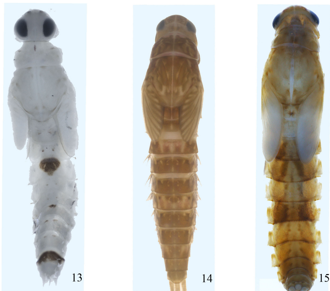
FIGURES 13-15. Baetidae nymphs, dorsal view. 13, Rivudiva trichobasis ; 14, Spiritiops silvudus ; 15, Waltzoyphius fasciatus .