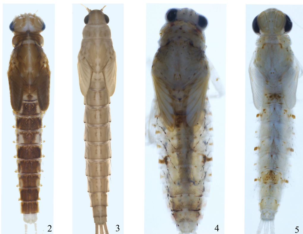
FIGURES 2-5. Baetidae nymphs, dorsal view. 2, Americabaetis alphus ; 3, A. longetron ; 4, A. fiuzai ; 5, Callibaetis pollens .