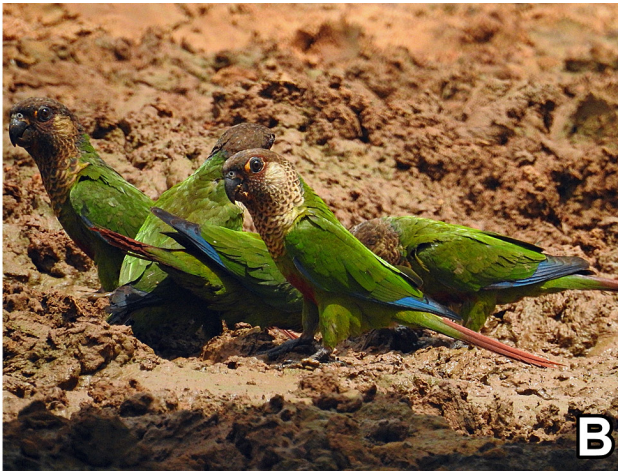
Figure 3. Photographic records of Pyrrhura lucianii at Fazenda União. Feeding on the fruit of the guava tree ( Psidium guajava ) ( A ). Flock landing on the ground and consuming salt ( B ).

tivated by man, as well as to consume salt at the property, suggesting that species has some flexibility to habitat disturbances.