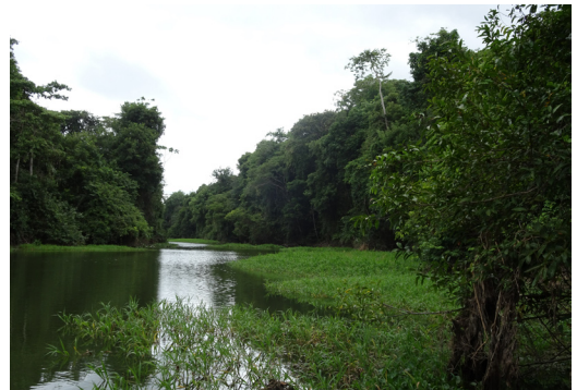
Figure 3. Slow moving water in drainage channels between islands with vegetation and sandy substrate are typical of the Xingu River below the Volta Grande waterfall.

In 2016, as a conservation action two areas were created encompassing the Refúgio de Vida Silvestre Tabuleiro do Embaubal and the Reserva de Desenvolvimento Sustentável de Souzel (RDS), covering 22,950 ha,