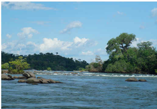
Figure 2. Rocky substrates and fast running water are characteristic of the middle and upper Xingu River above the Volta Grande waterfall.

Literature reports of the species' distribution include the whole Xingu River Basin, except for part of the Upper Xingu, in the state of Mato Grosso, and the region of Serra do Cachimbo, in Pará, covering a total of 5,981,145 km 2 . Excluding the middle Xingu up to the