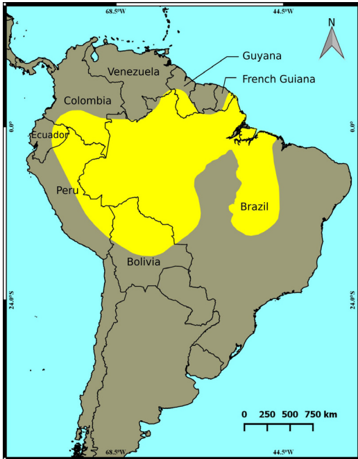
Figure 4. Melanosuchus niger distribution map showing the reduction in area in the Xingu River basin.

including all the vegetated islands below the great waterfall of the Volta Grande do Xingu, in order to protect aquatic vertebrates such as turtles, crocodylians, dolphins and manatees. These areas will likely protect M. niger from hunters and other human actions, but, they may be impacted by reductions in river flow due to the Belo Monte dam, which now represents the geographical limit of the species in the Xingu River.