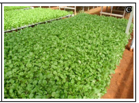
Figure 3. Mechanization (A), packaging (B) and protected cultivation (C) as a response to some of the challenges or constraints faced by growers and other agents of the production chain.