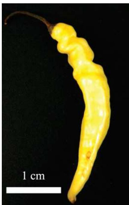
Photo 1. Murupi chili pepper pod. Manaus 2013. Manaus, INPA, 2013.

Means with the same letter in the column indicate non-significant differences by Scott-Knott test ( P < 0.05 ).