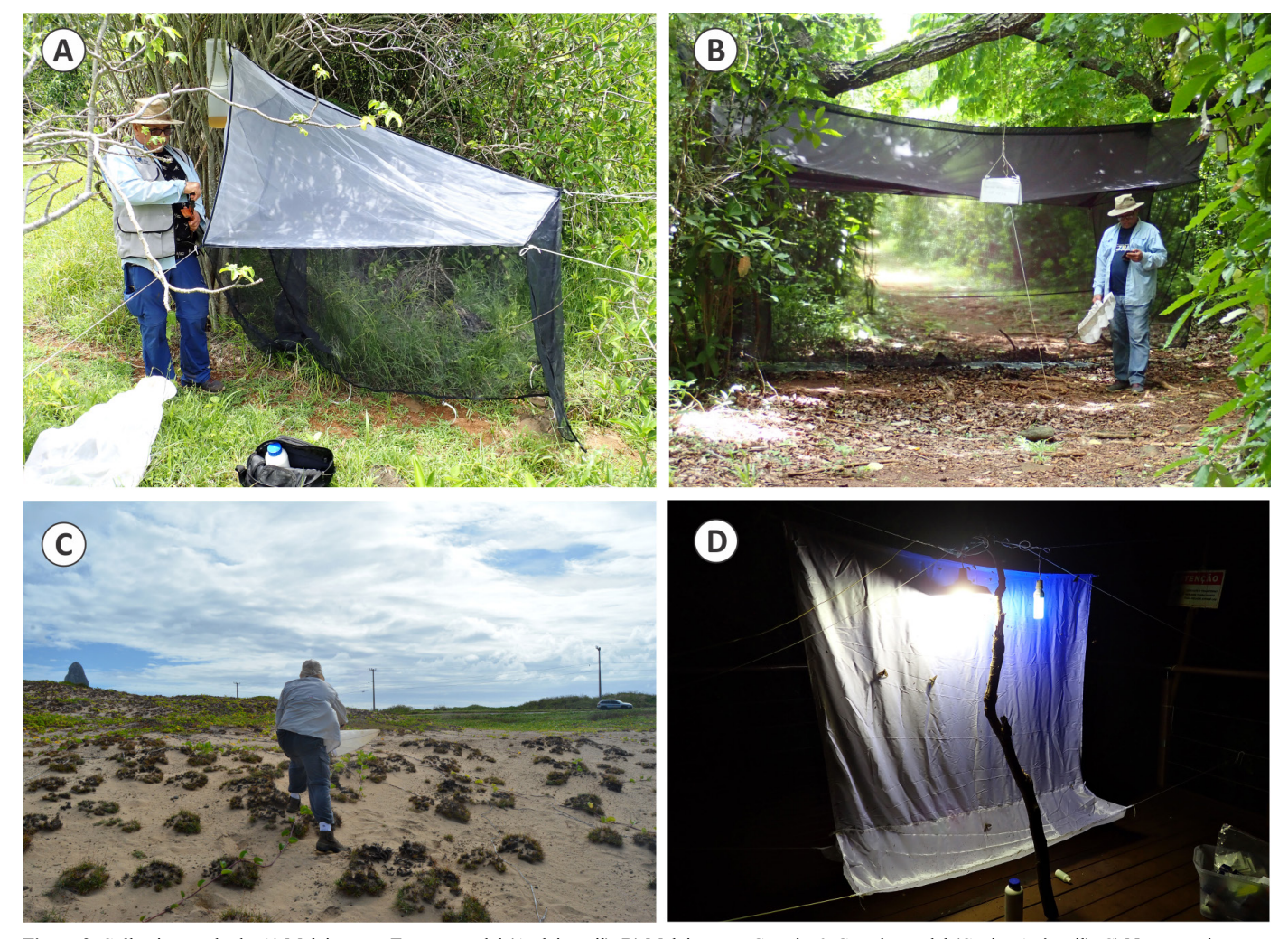
Figure 2. Collection methods: A) Malaise trap, Townes model (Atalaia trail); B) Malaise trap, Gressitt & Gressitt model (Capim-Açú trail); C) Net sweeping over dunes (area around the Fernando de Noronha harbor); D) Light trap, UV and mercury lamps (Golfinhos trail).

Additionally, insects were sampled using Malaise interception traps from 2 to 9 June 2019 and from 20 to 27 February 2020, with additional points of collection in the following locations of the main island: