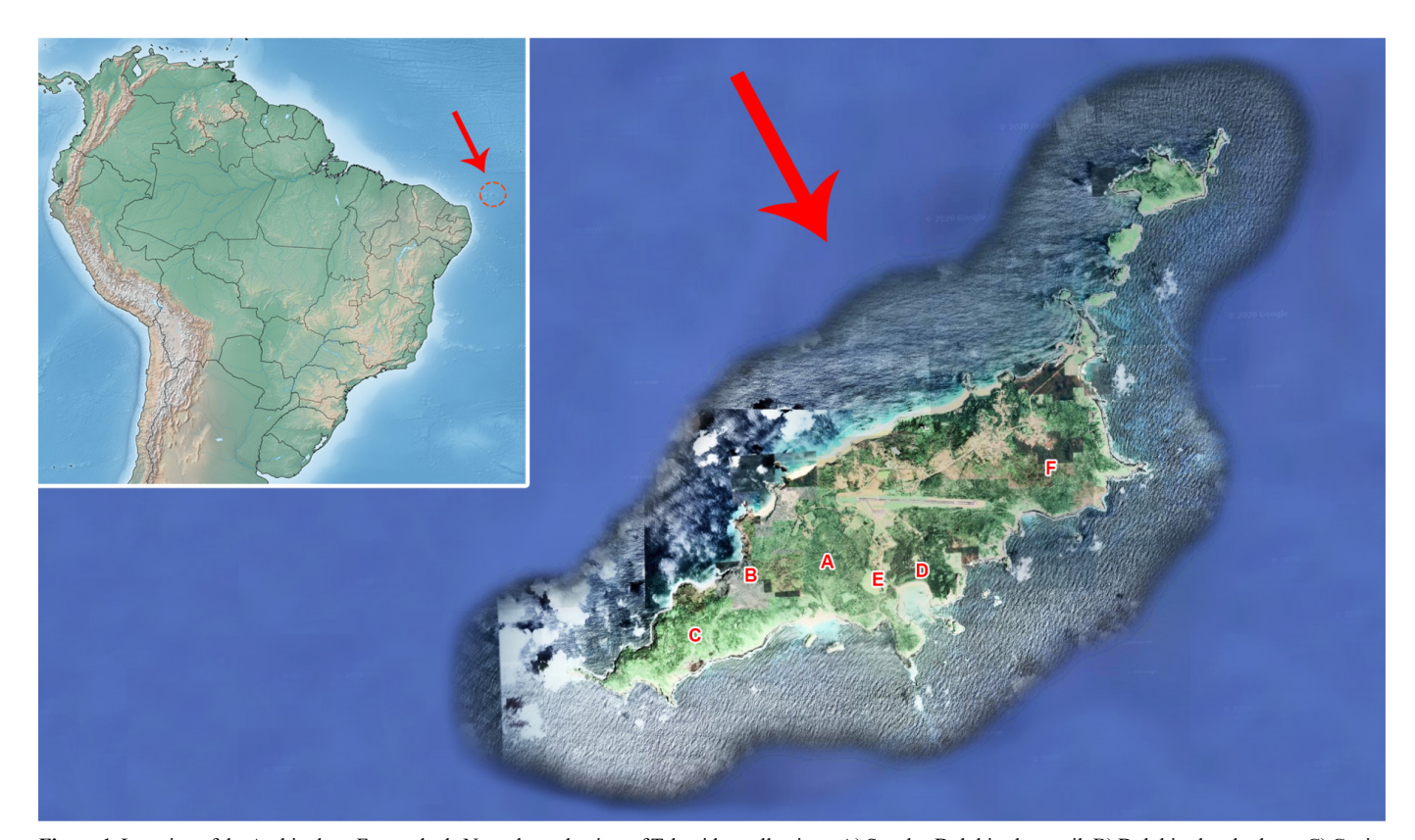
Figure 1. Location of the Archipelago Fernando de Noronha and points of Tabanidae collections: A) Sancho-Dolphins bay trail; B) Dolphins bay lookout; C) Capim-Açú trail; D) Mangrove; E) Xaréu pond; F) Atalaia trail.

The Fernando de Noronha archipelago (latitude 3°45'S to 3°57'S; longitude 32°19'W to 32°41'W) (Figure 1) is of volcanic origin and was never connected to the continent. It has a tropical oceanic climate (Awi - Köppen classification). The temperature ranges from 23.5°C