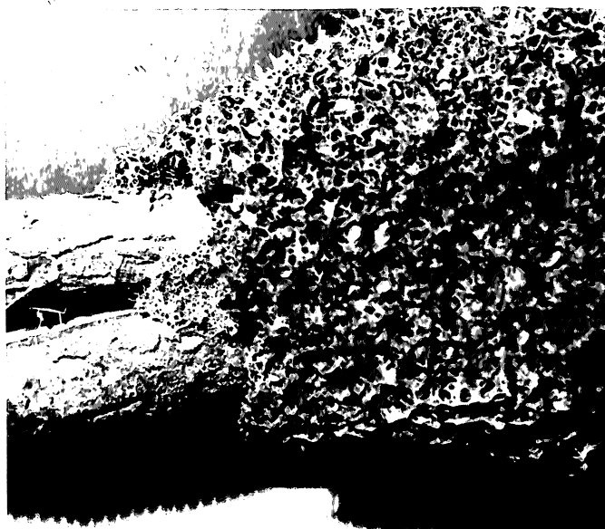
Fig. 3. Part of photomicrograph no. 2 was enlarged to show different levels of penetration by the mollusk, as well as almost complete occupation of the sponge reticulum by a whole "population" of the bivalve.